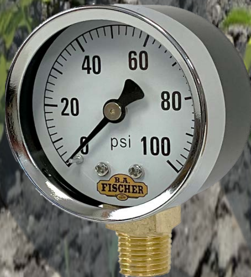
Dry Gauge Black Steel Case Range: 0-100#