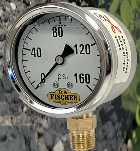
Liquid Filled Stainless Steel Case Range: 0-160#