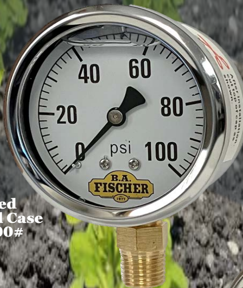
Liquid Filled Stainless Steel Case Range: 0-100#